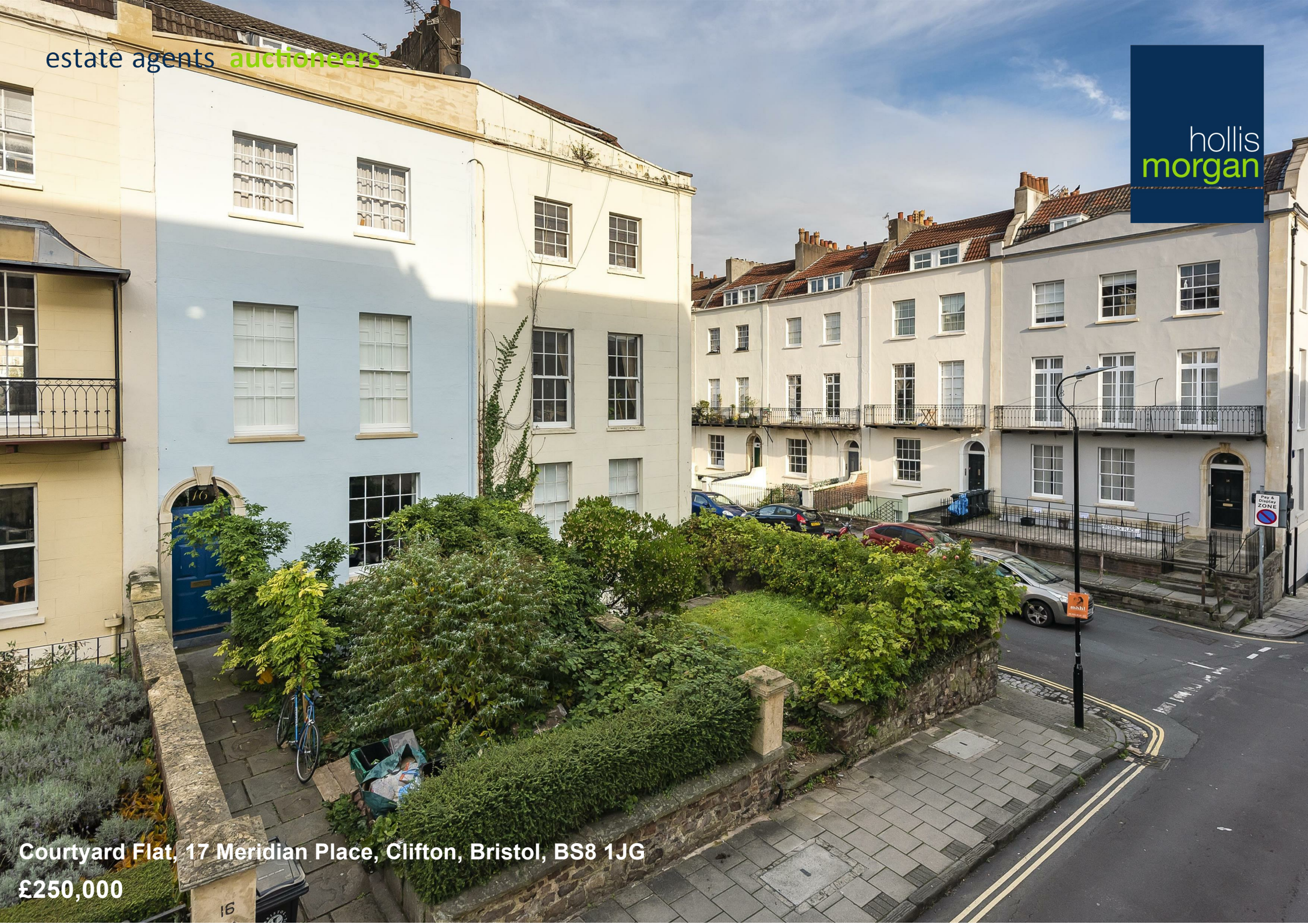
Courtyard Flat, 17 Meridian Place, Clifton, Bristol, BS8 1JG £250,000